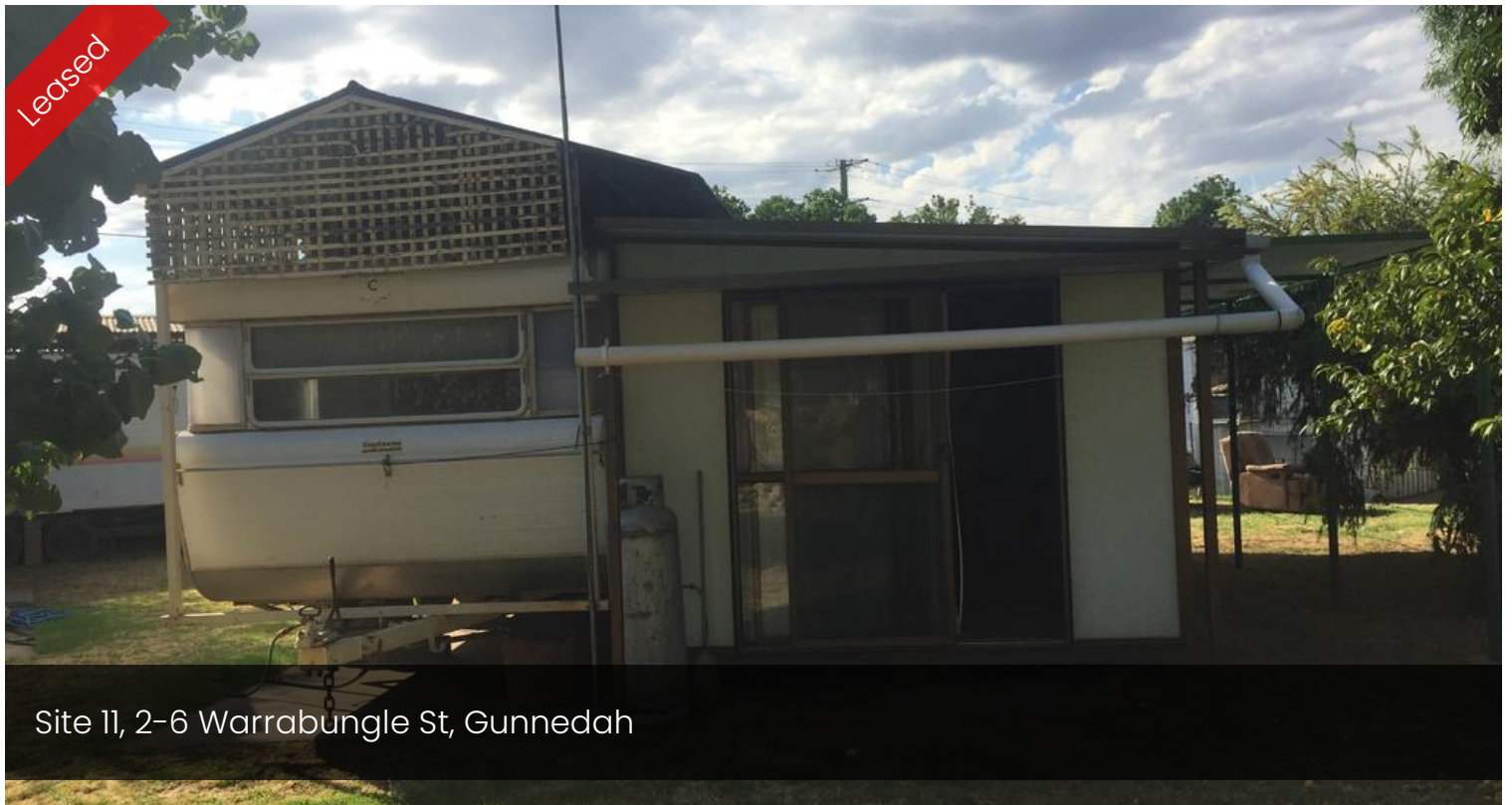
Site 11, 2-6 Warrabungle St, Gunnedah