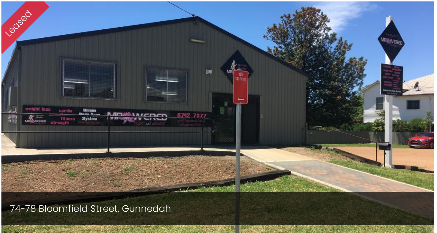
74-78 Bloomfield Street, Gunnedah