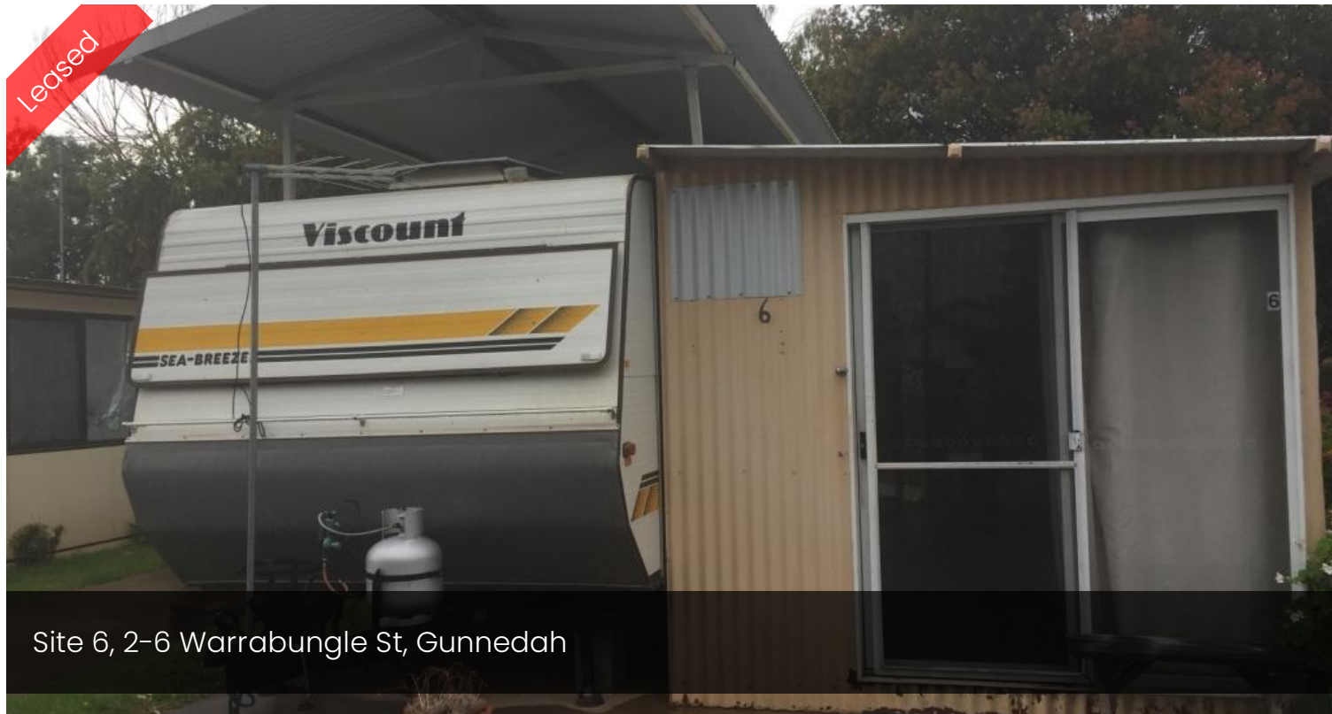
Site 6, 2-6 Warrabungle St, Gunnedah