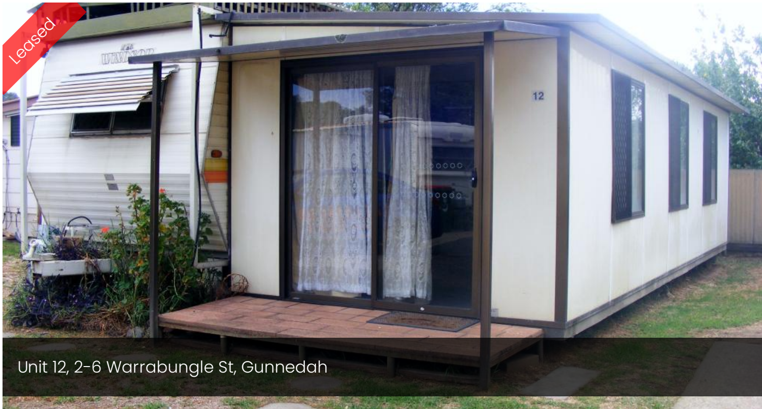
Unit 12, 2-6 Warrabungle St, Gunnedah