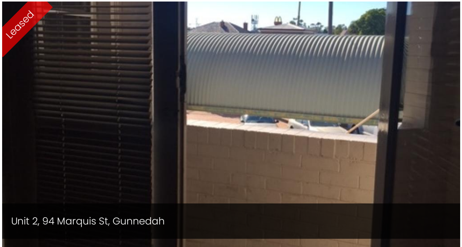
Unit 2, 94 Marquis St, Gunnedah