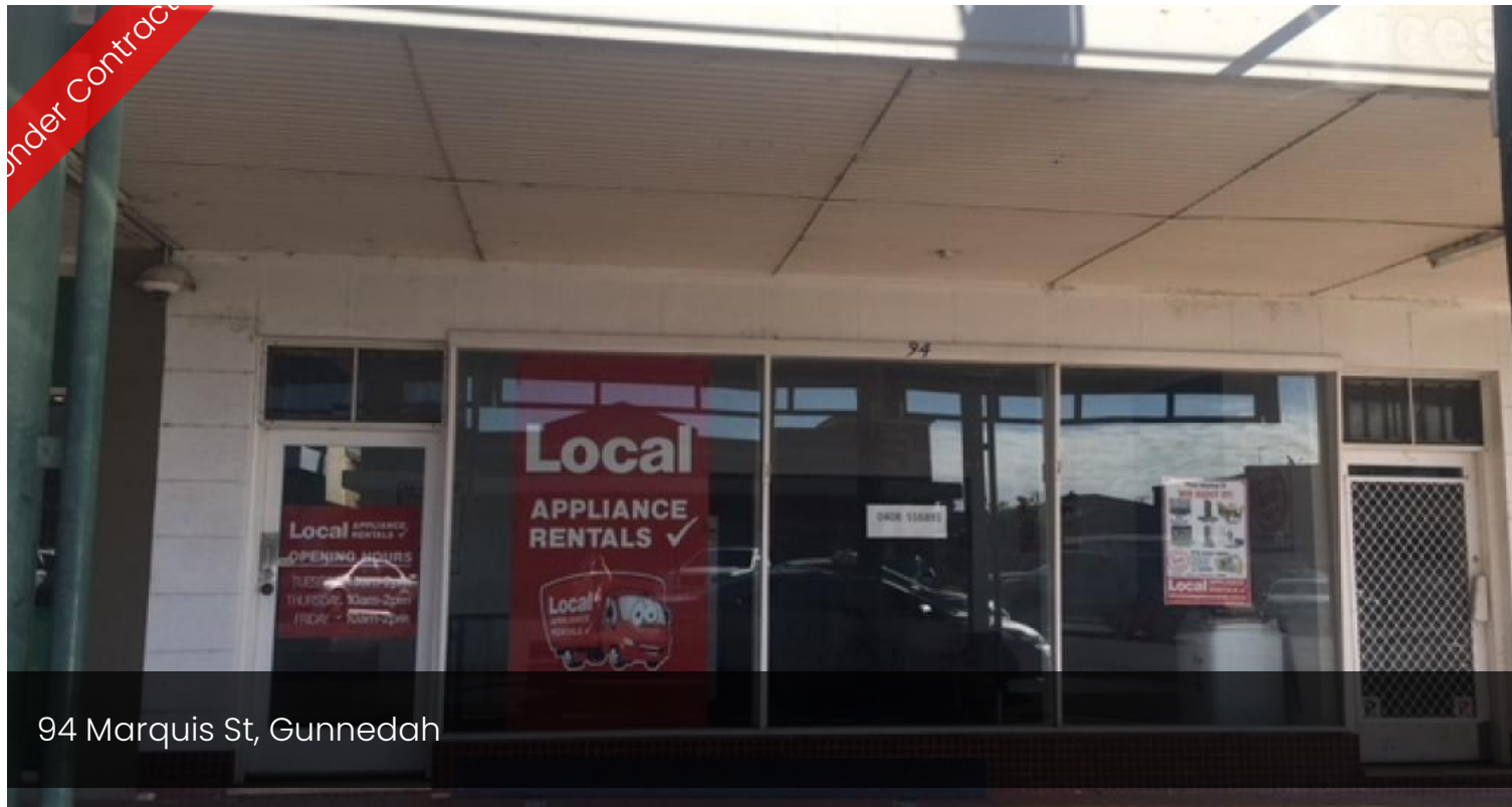
94 Marquis St, Gunnedah