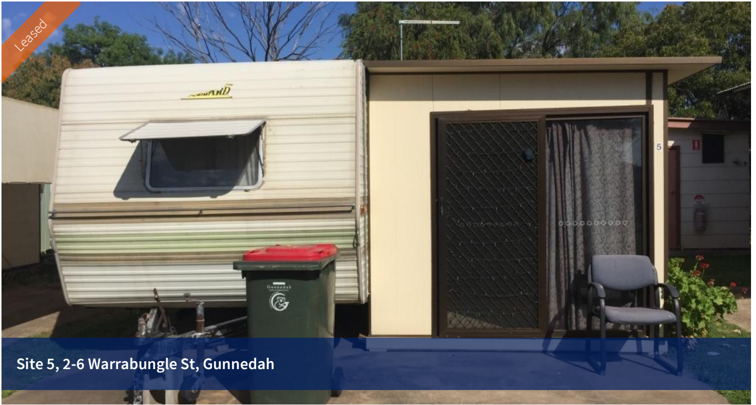
Site 5, 2-6 Warrabungle St, Gunnedah