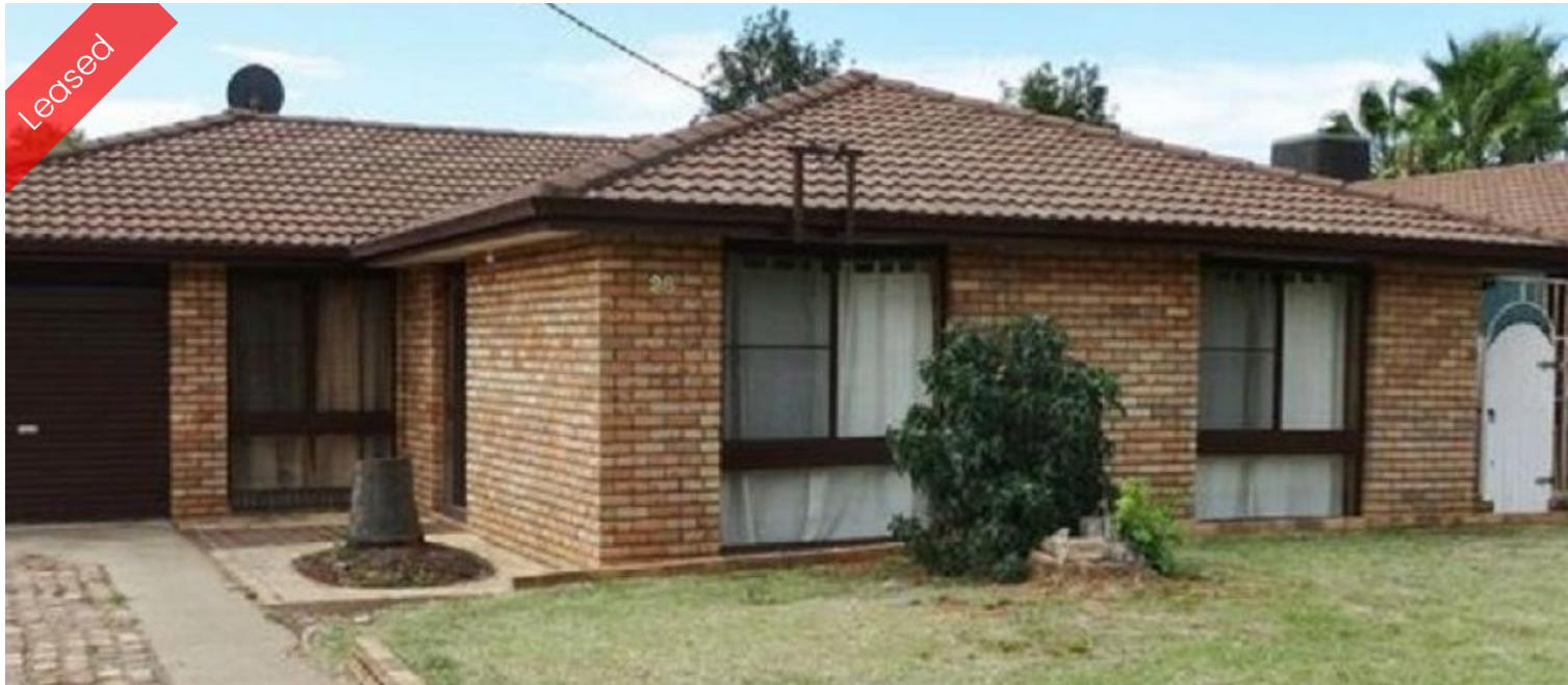
26 Bando Street, GUNNEDAH