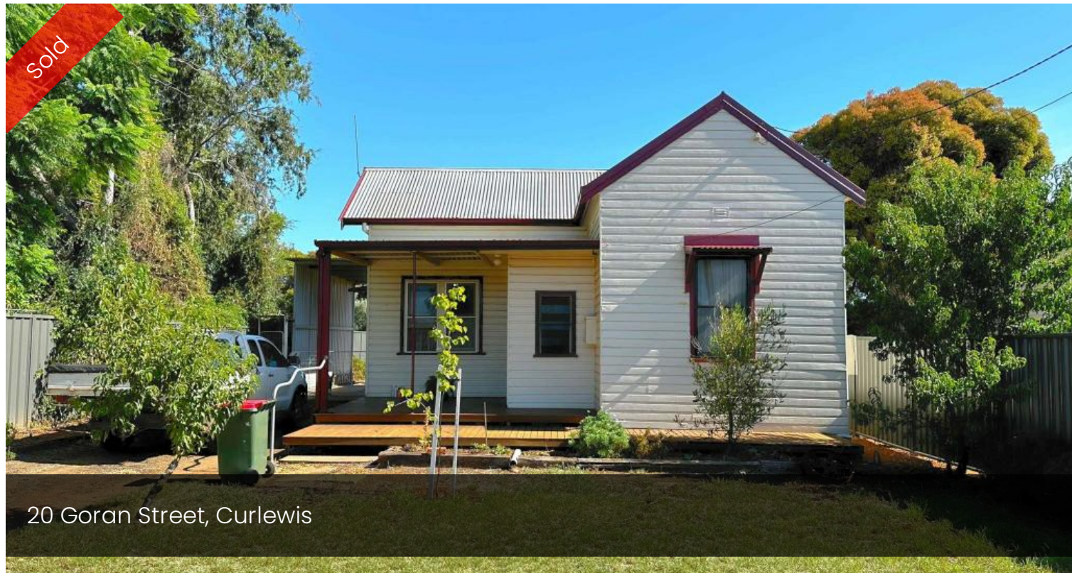
20 Goran Street, Curlewis