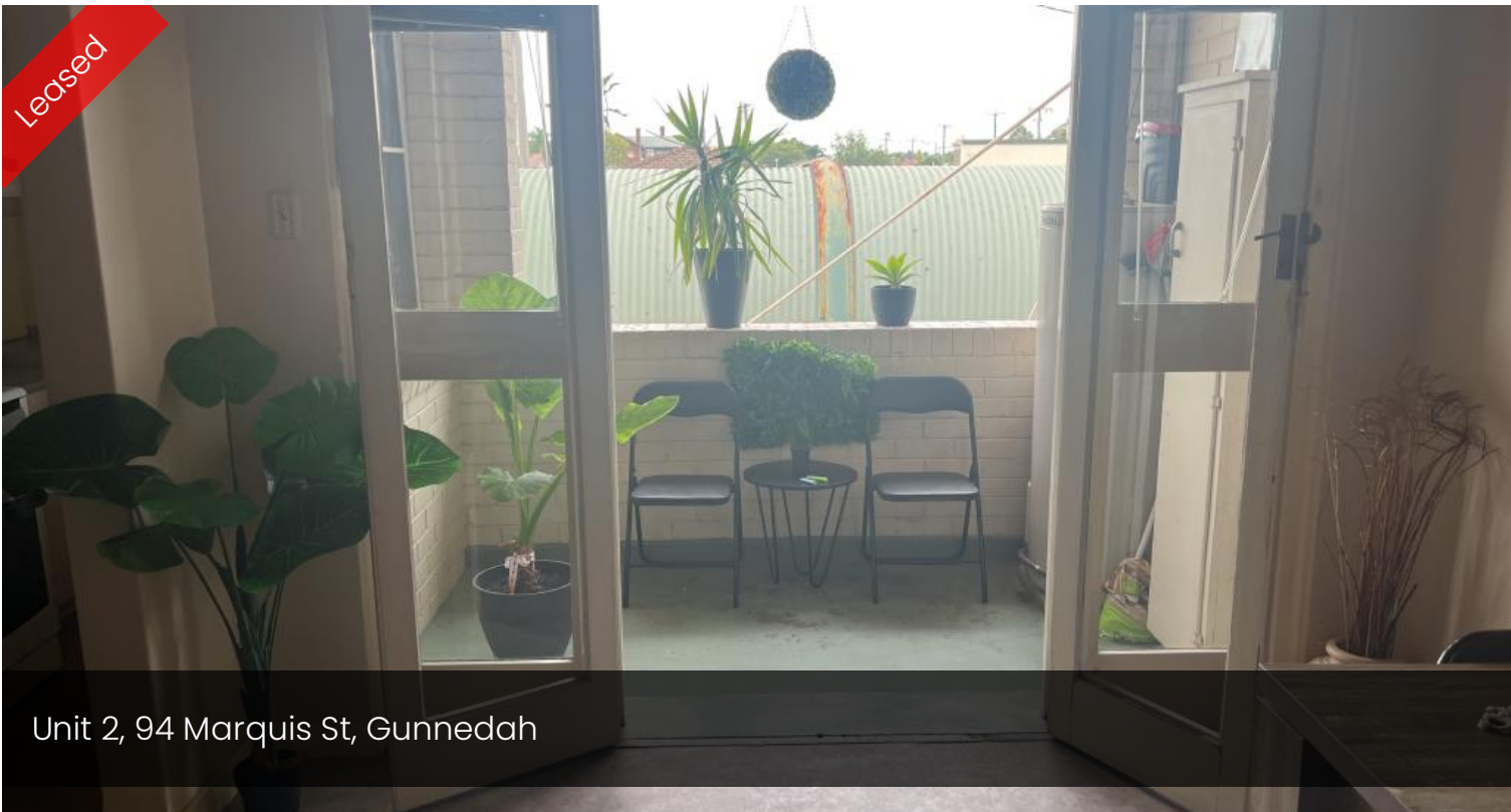
Unit 2, 94 Marquis St, Gunnedah