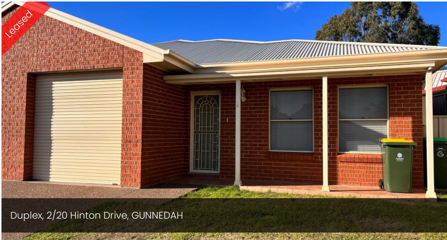
Duplex, 2/20 Hinton Drive, GUNNEDAH