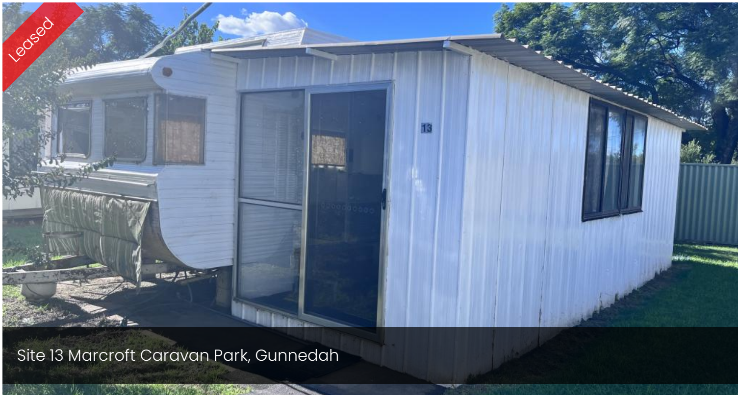
Site 13 Marcroft Caravan Park, Gunnedah