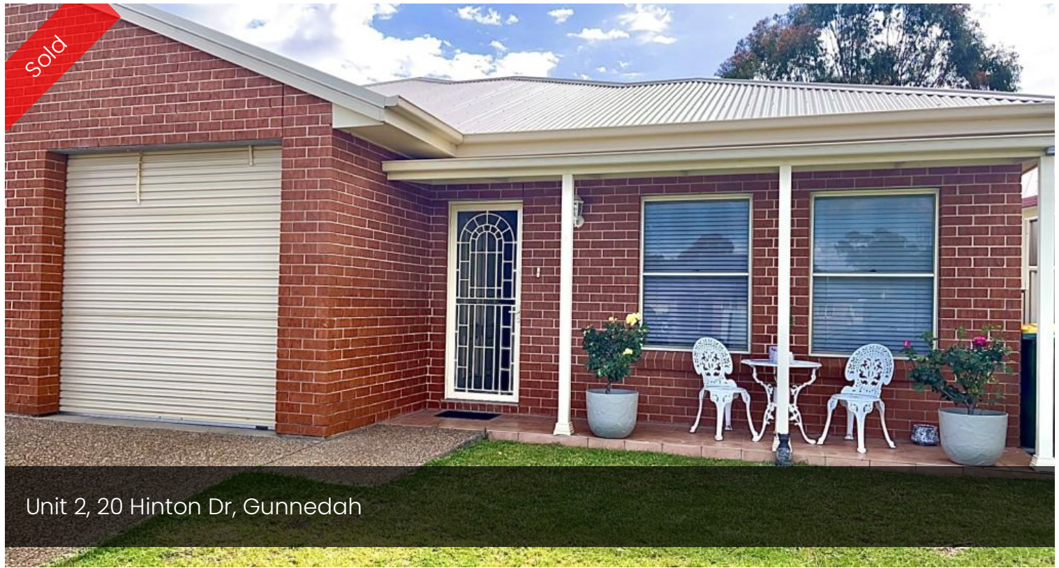
Unit 2, 20 Hinton Dr, Gunnedah