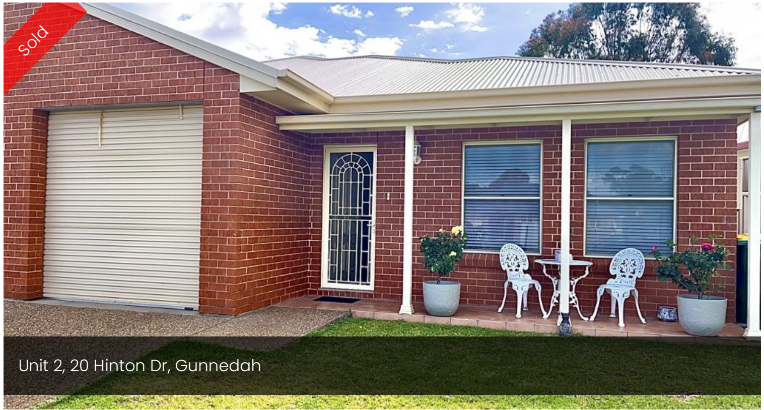
Unit 2, 20 Hinton Dr, Gunnedah